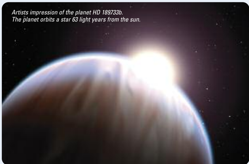
Artists impression of the planet HD 189733b. The planet orbits a star 63 light years from the sun.

■ Water vapour in the atmosphere of a transiting extrasolar planet. Nature , 2007.